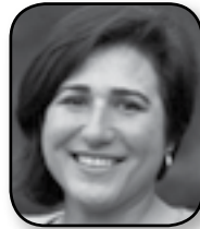
Sen. Emily Randall

in the upcoming legislative session related to their issue.