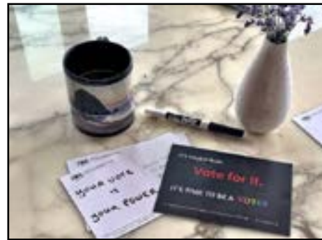
Photo illustration by Ann Strosnider League members volunteered to write postcards to be sent to residents of three Bremerton precincts with known low voter turnout rates.

Before Pennsylvania's 2016 election, 2 million postcards were sent