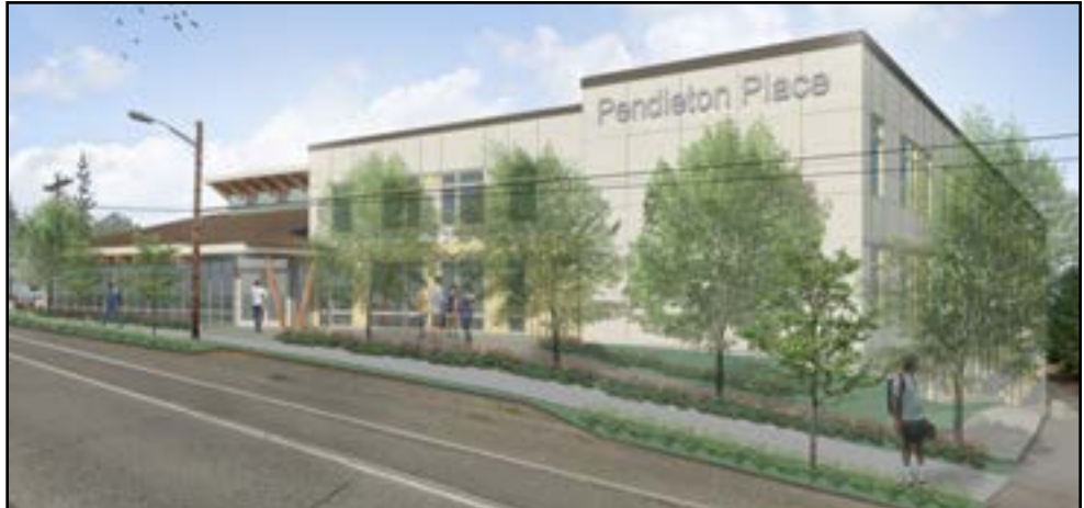
Artist's rendering of Pendleton Place on Kitsap Way in Bremerton.