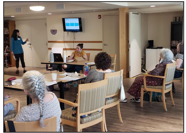
LWVK September presentation and all member social.