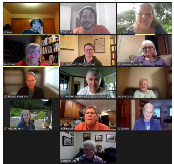
New moderators train for fall forums.

Oct. 4, 7:30 p.m.: South Kitsap Fire and Rescue Commissioner, Pos. 3. (Hybrid). Watch in person at Port Orchard City Hall or live on Zoom.