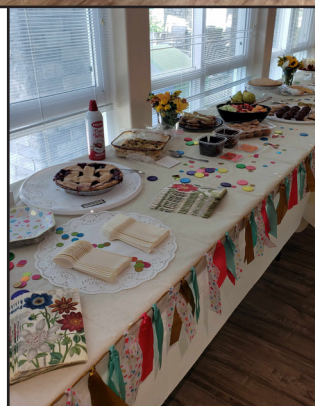
LWVK September presentation and all member social.

After the last election, the Board began discussing ideas for how to better manage the LWVK business and what we could do to help bring members together. We learned through board member transitioning that so much of what we do and how we manage League business – all critical processes – are done via multiple manual processes, sometimes personal accounts, and rely on members to recall activities and safeguard important information. It can be cumbersome, inefficient, and just isn’t sustainable now that so much of what we do is electronic. Even the simple task of finding past communications relies on people to remember who might have it and then you hope they can find it. Imagine hunting through boxes to find the record that you are looking for – Ugh!